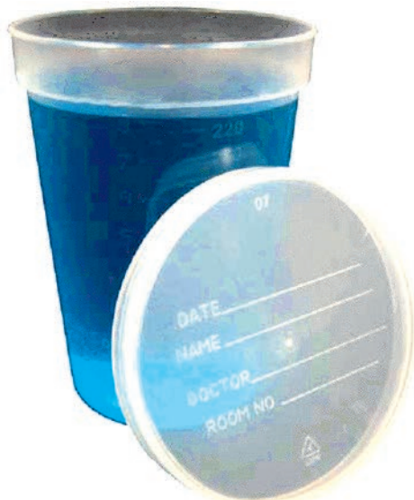
Filled with dye to illustrate details