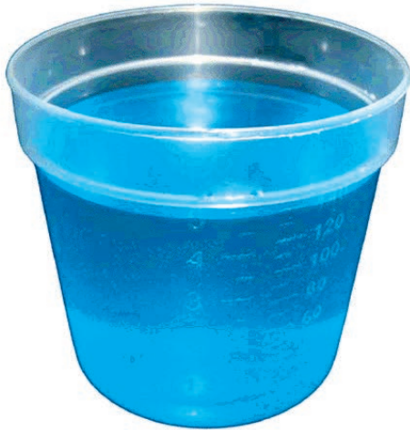
Filled with dye to illustrate details