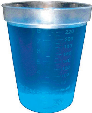
Filled with dye to illustrate details