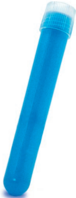
Filled with dye to illustrate details