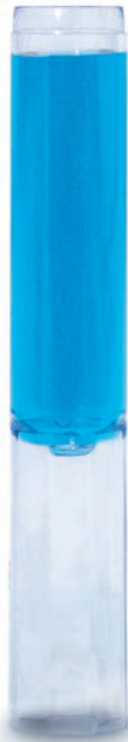
Filled with dye to illustrate details